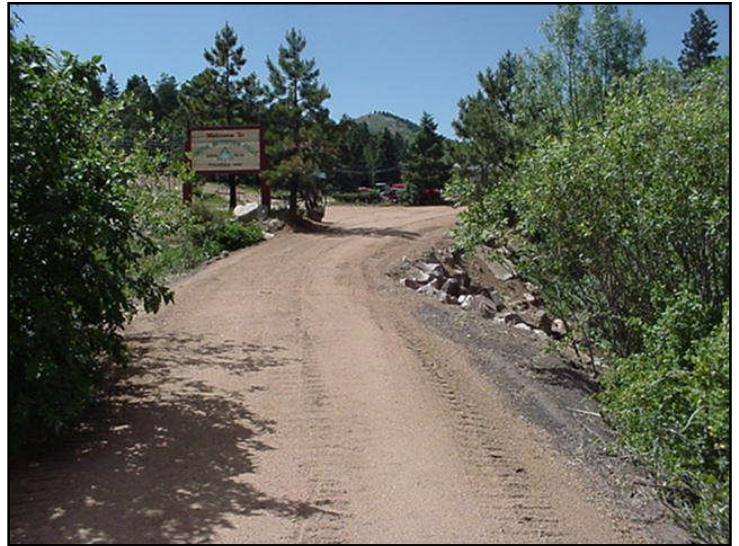
Ute Pass Trail

Ute Pass Trail can be reached from west Hwy. 24 at the Green Mountain Falls Elementary School on Chipita Park Rd.. The part in Woodland Park can be reached behind Safeway on Hwy. 24.