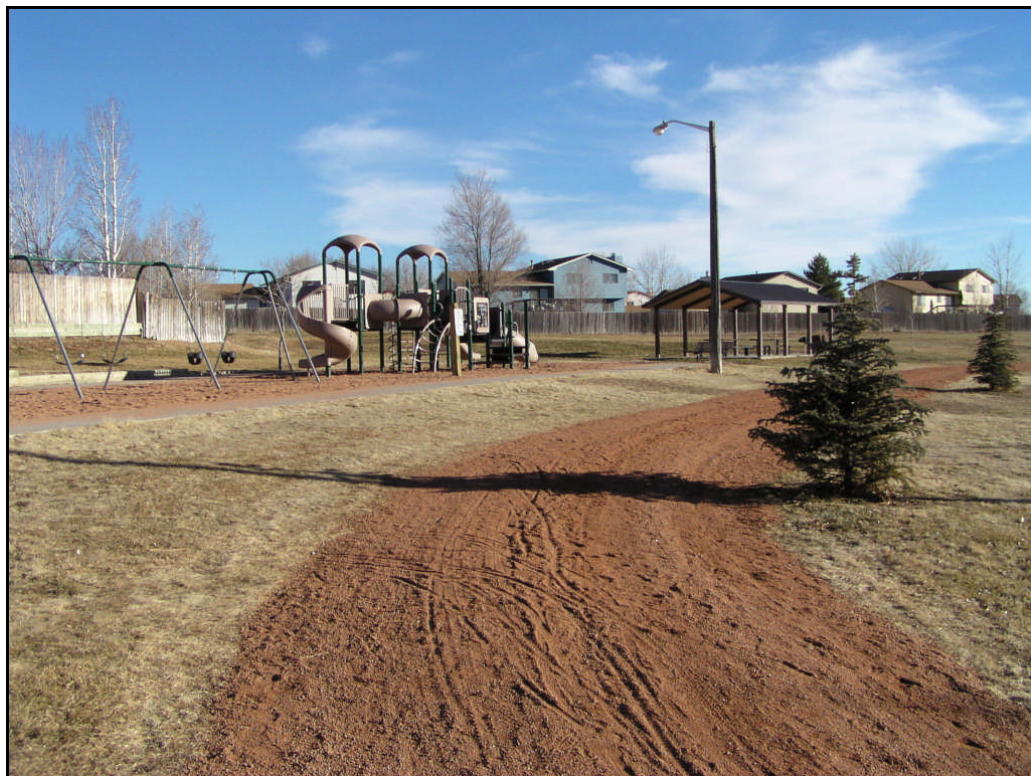
Fountain Mesa Trail